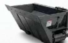
Side Discharge Bucket