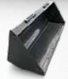
Dirt and Foundry Bucket