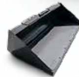
Low-Profile Extended Lip Bucket

In addition to the selection of more than 250 buckets, forks, brooms, hydraulic hammers, snow accessories, bale spears and other CASE attachments available, Alpha Series loaders are compatible with CASE compact wheel loader attachments. CASE also has partnerships with numerous attachment manufacturers for even greater versatility. Consult your dealer for details.