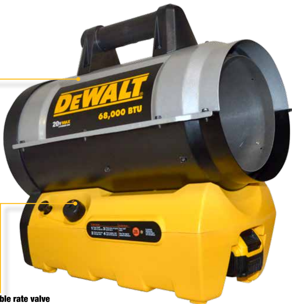
Variable rate valve

Electrostatic powder-coat finish ensures long life and protection for internal components